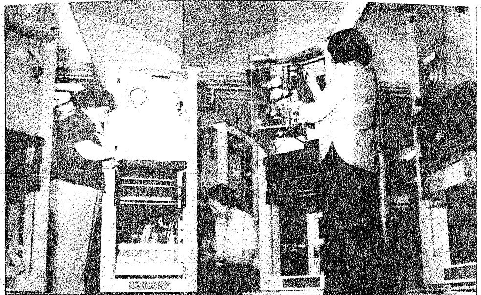
Redifon's R850 central processor being assembled at the Redifon plant in Crawley, Surrey