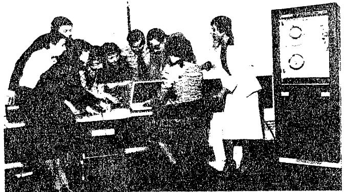
R850 IS POPULAR IN POLAND

Nine contracts for R-range systems were taken, to the value of £500,000 at the exhibition, establishing RCL as market leaders in the sale of distributed data entry systems. Czechoslovakia is the largest export market for the company, with a total of 80 installations in the country.