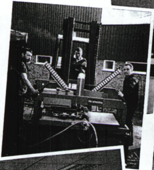
Left, this is the new Blundell flow solder machine.