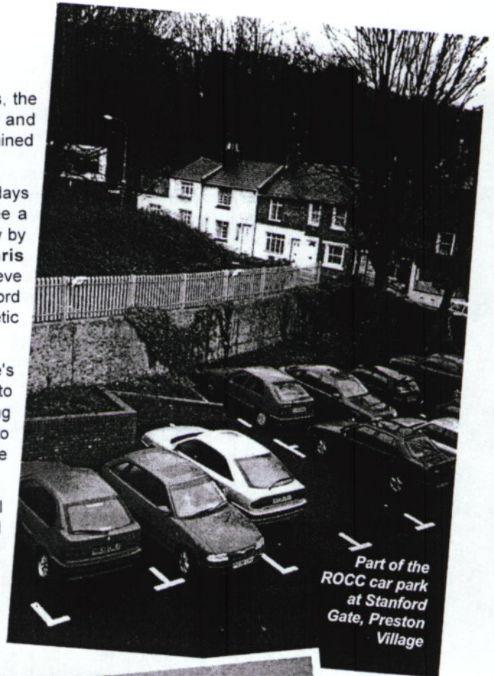
Part of the ROCC car park at Stanford Gate, Preston Village