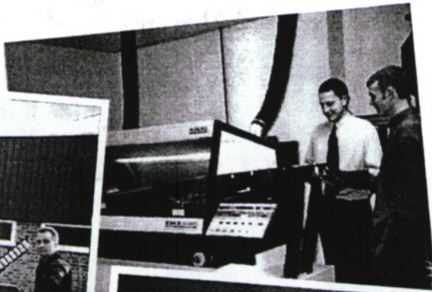
Far left, the Amistar machine arrives at Maxwell Way.