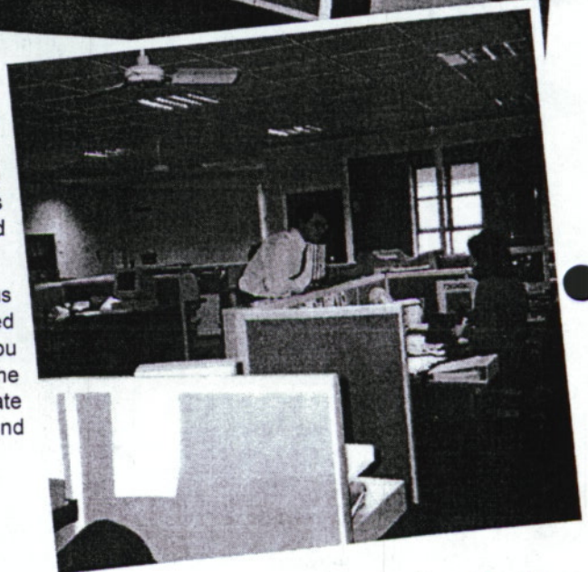
This sequence of pictures shows how things were transformed at Stanford Gate. At the top, the comms system is being installed; centre shows the programmers' new den being created; at the bottom is the new customer services operation.