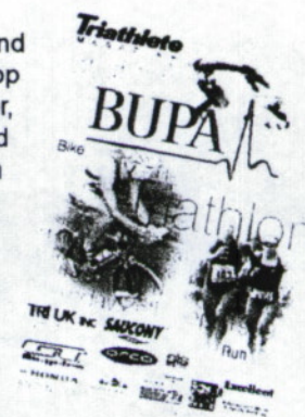
BUPA's programme and the Triathlon '99 course plan