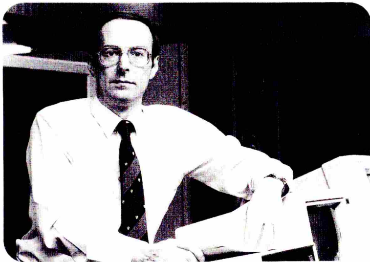
Cook... "We expect the mix of our services to change in the next couple of years."

a staff of over half a million. Since there is a common pay structure across the Civil Service we have been able to market a single payroll product across departments. As we process more and more work, our unit costs decrease, making us very economic to use."