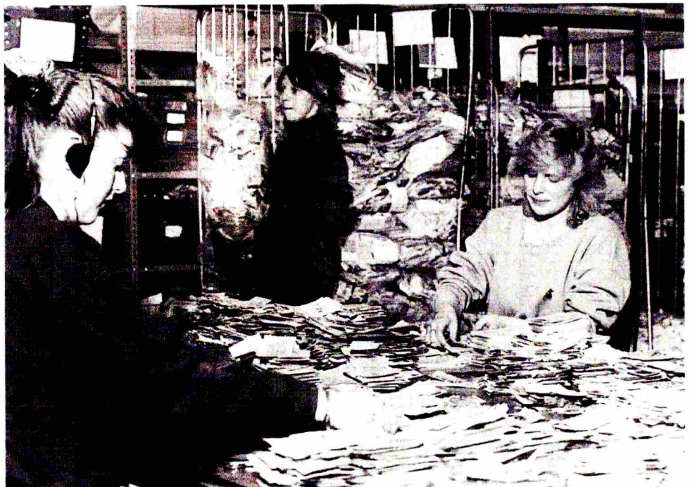
Coupons are first sorted into groups according to face value, then sub-divided by manufacturers and finally by offer code.

"NCH will only stay ahead by looking forward. We are looking beyond our traditional stronghold of coupons redemption, to extending our presence in promotions fulfilment, by offering a more efficient, accurate and cost effective promotion fulfilment service than offered by in-house departments. This will only be possible where our technology is flexible enough to grow and change to meet our evolving requirements. The ROCC 2835 keeps these avenues open," concluded Robinson. ■