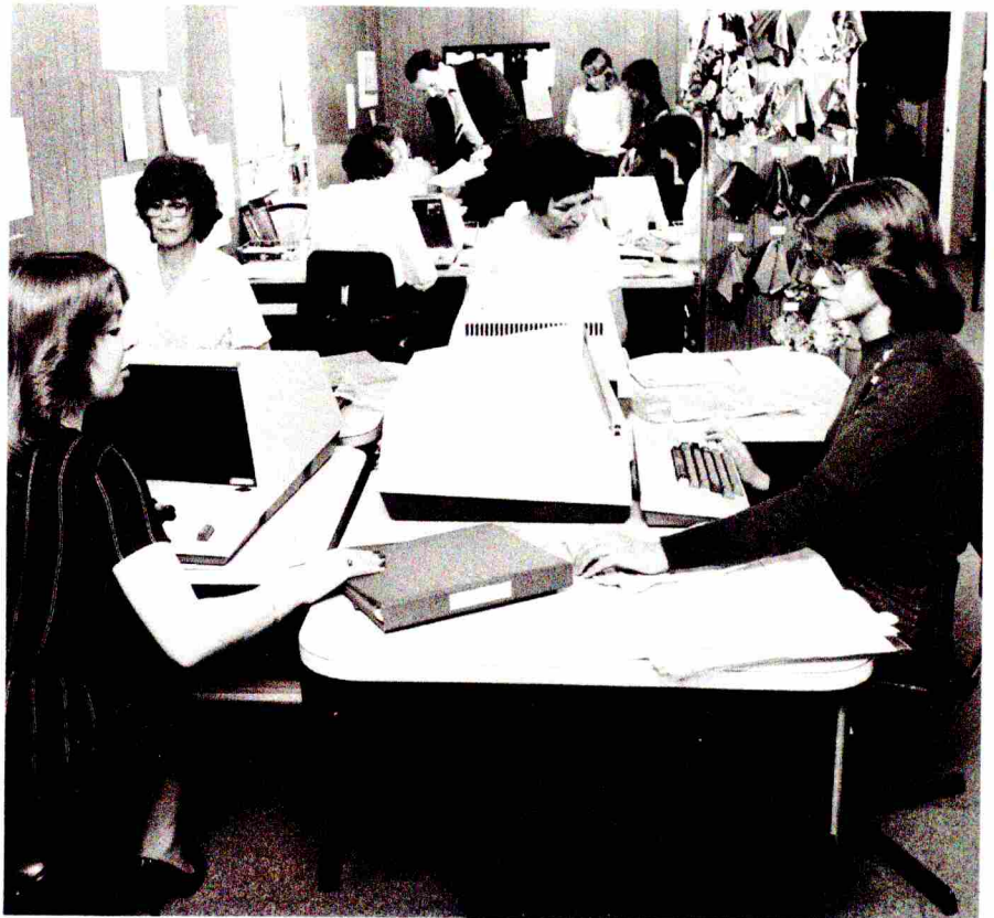
Fourteen VDUs are installed in the busy punch room at Plumbs (Mail Order) where the operators key in orders, enquiries and coupon details. The data is then processed on twin Rediffusion R800 processors.

installing it and was fully involved in the testing process and in training the staff. Now they just get on with it without any intervention from me."