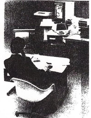
Redifon Computers Future Office System is an integrated office system capable of handling data, text, image and graphics from three sources - 'intelligent' televisions, hand-print terminals and visual display units. It is this which makes the system unique.

The various "service" businesses, particularly travel agents, estate agents and insurance brokers will be immediately affected. Real-time transaction completion and improved communication will change the nature of the business.